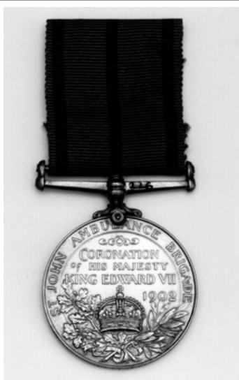
Coronation Medal, 1902