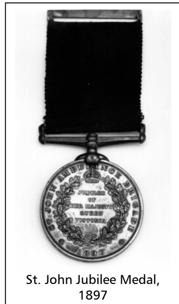
St. John Jubilee Medal, 1897

has a central legend JUBILEE OF HER MAJESTY QUEEN VICTORIA within a crowned wreath. Outside this appears, at the top, the name of the organisation served and, at the bottom, the date 1897. There are five different versions: Metropolitan Police, City of London Police, Police Ambulance, London County Council Metropolitan Fire Brigade and St. John Ambulance Brigade. The medal was issued to St. John members in bronze and has the rank and name of the recipient engraved around the rim. An analysis of the reports made after the event shows that there were 910 members of the Brigade on duty: 36 Honorary Surgeons, 771 officers and men and 103 Nursing Sisters.